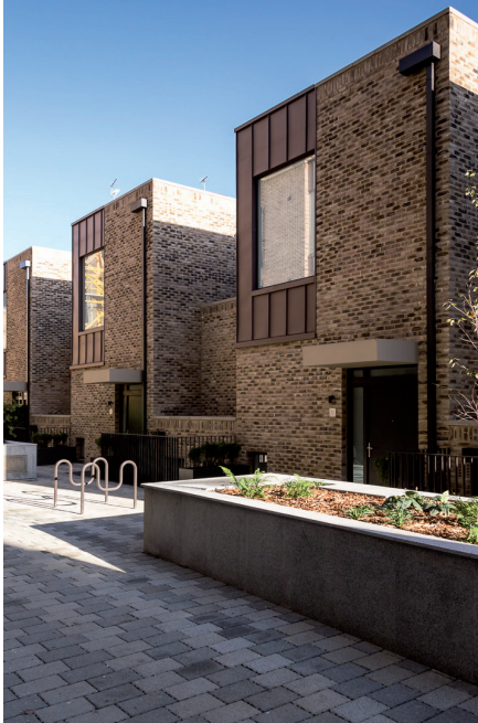
St Pancras Place (above) and Anchorage House, London (below) both use Radmat Blue Roof systems finished with either green roofs or paving and planters.

The management of rainfall within the built environment is an important task for the construction industry, with correct and sympathetic source control and attenuation being key to Sustainable Urban Drainage System (SuDS) design.